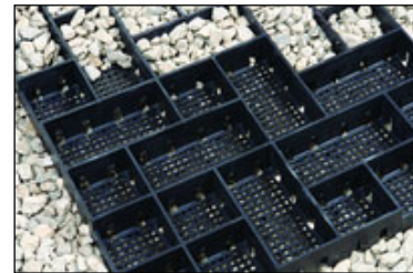
Figure 2 Cell Configuration